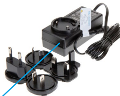
World Traveller Power Supply