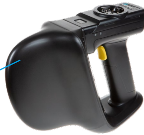
2128L UHF RFID Reader