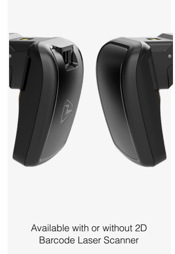
Available with or without 2D Barcode Laser Scanner