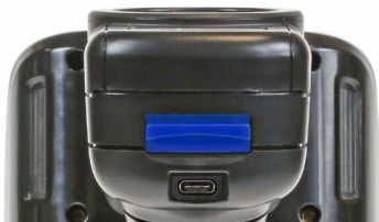
USB-C connector option