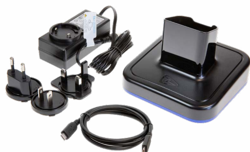
3138 Docking Cradle Kit