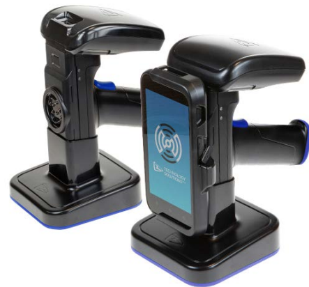
Charge the 3138 Reader and host device (via ePop-Loq® mounts)