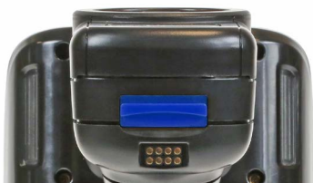
8-Way Power Pin connector option, for use with Docking Cradle