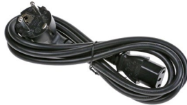
For EU, order: IEC-1.8M-EU