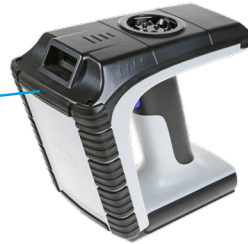
3166 RAIN RFID UHF Reader

Battery (may already be already installed in the Reader). Please note that new batteries are discharged to less than 30% of their maximum capacity before shipping.