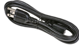
For US, order: IEC-1.8M-US