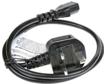
For UK, order: IEC-1M-UK