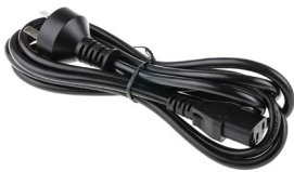
For AU/NZ, order: IEC-2M-AU-NZ